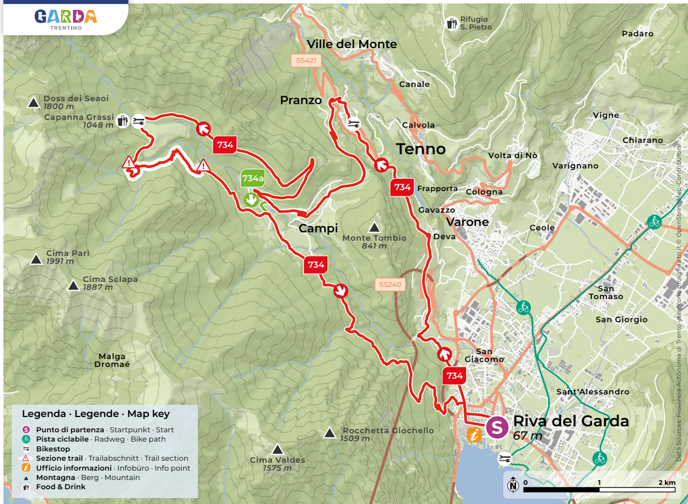
Design and cartography 2024 | max2.at