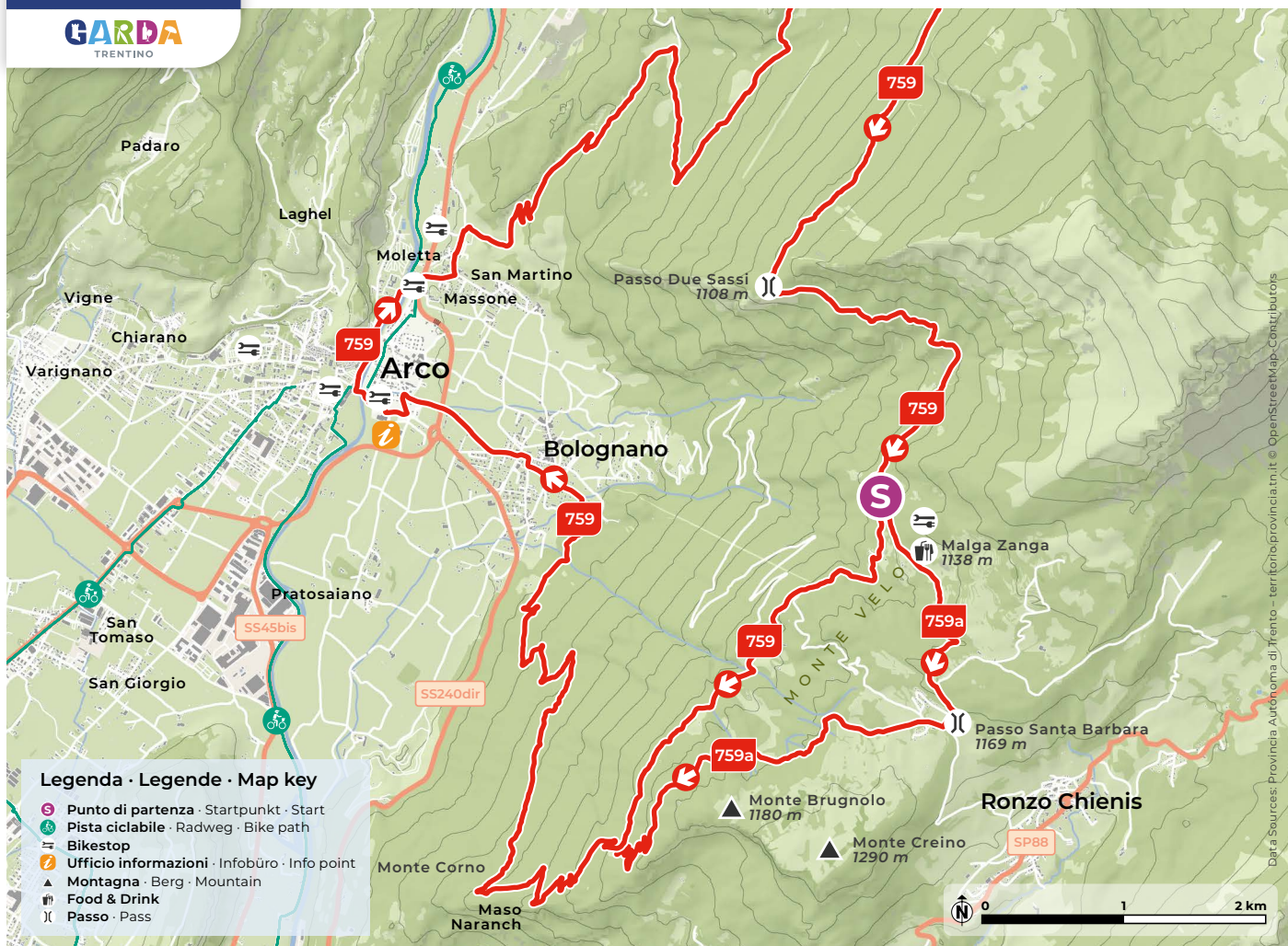
Design and cartography 2024 | max2.at