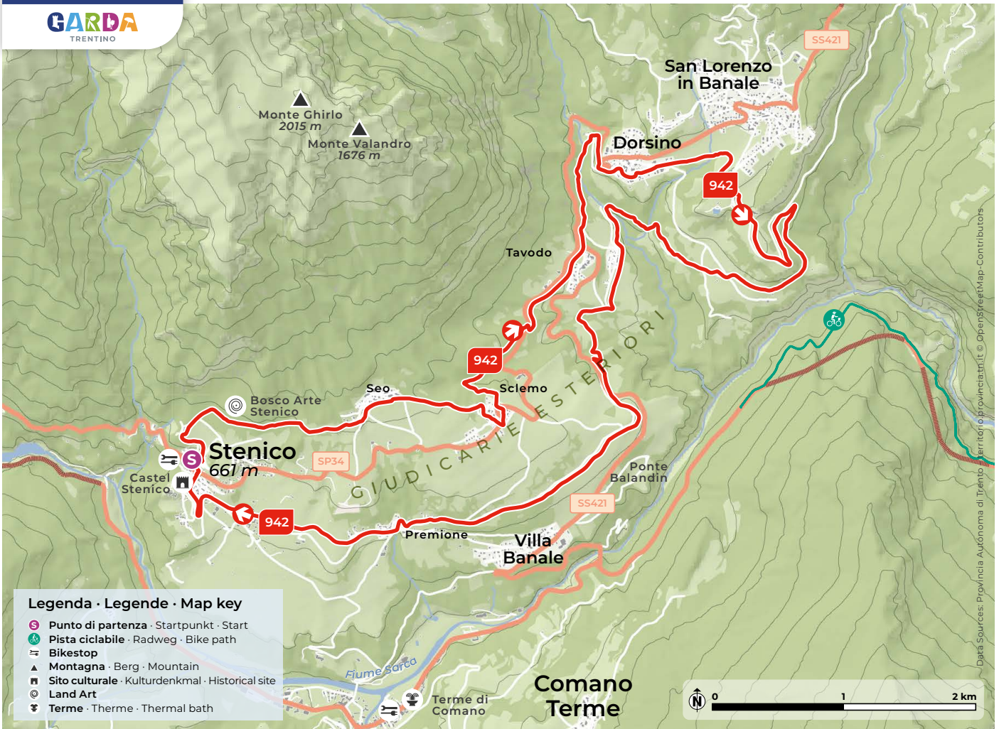
Design and cartography 2024 | max2.at