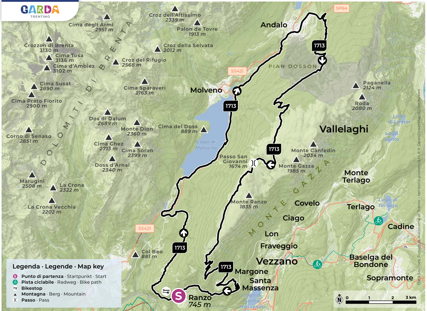
Design and cartography 2024 | max2.at